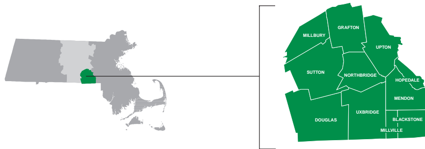
Also see map on inside back cover.

Will the Route 146 — Massachusetts Turnpike intersection help the Blackstone Valley meet its economic potential?